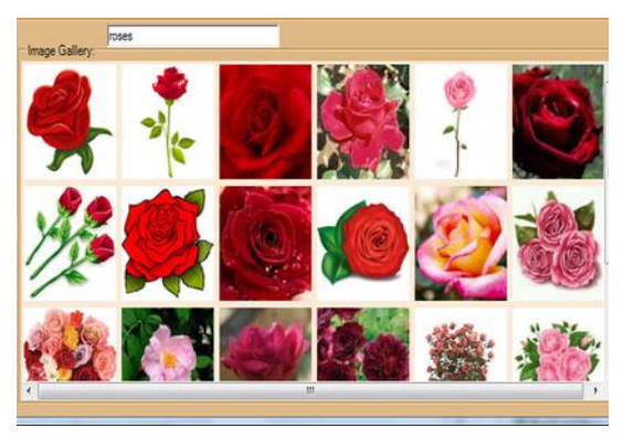
Figure 2.0 sample dataset under the flower category

Dataset: The implementation has performed with 10 image dataset from the different image repository. The dataset is namely Birds (100 training images), roses (81 training images), Flower (106 training images), Face (133 training images), Fruit (89 training images), House (100 training images), Lake (100 training images), Mountain (110 training images), Plane and Sunset (130 training images). This finally has chosen 300 images randomly from each category for training purpose with its textual descriptions. The images are real world, and with high intra-class variability. Using the different set of databases, it is possible to evaluate retrieval results. The datasets are crawled from the Google website.